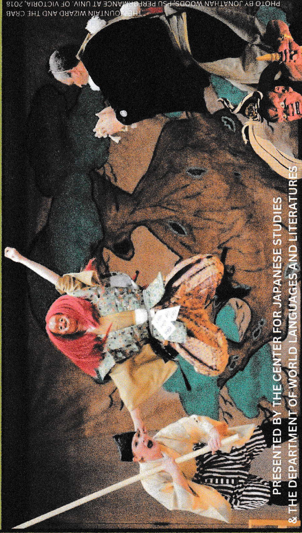
THE MOUNTAIN WIZARD AND THE CRAB PHOTO BY JONATHAN WOODS, PSU PERFORMANCE AT UNIV. OF VICTORIA, 2018

PRESENTED BY THE CENTER FOR JAPANESE STUDIES & THE DEPARTMENT OF WORLD LANGUAGES AND LITERATURES