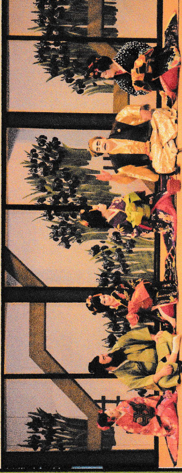
PLEASURE QUARTER PARTYING, FROM THE ADVENTURES OF HIGH PRIEST KOCHI